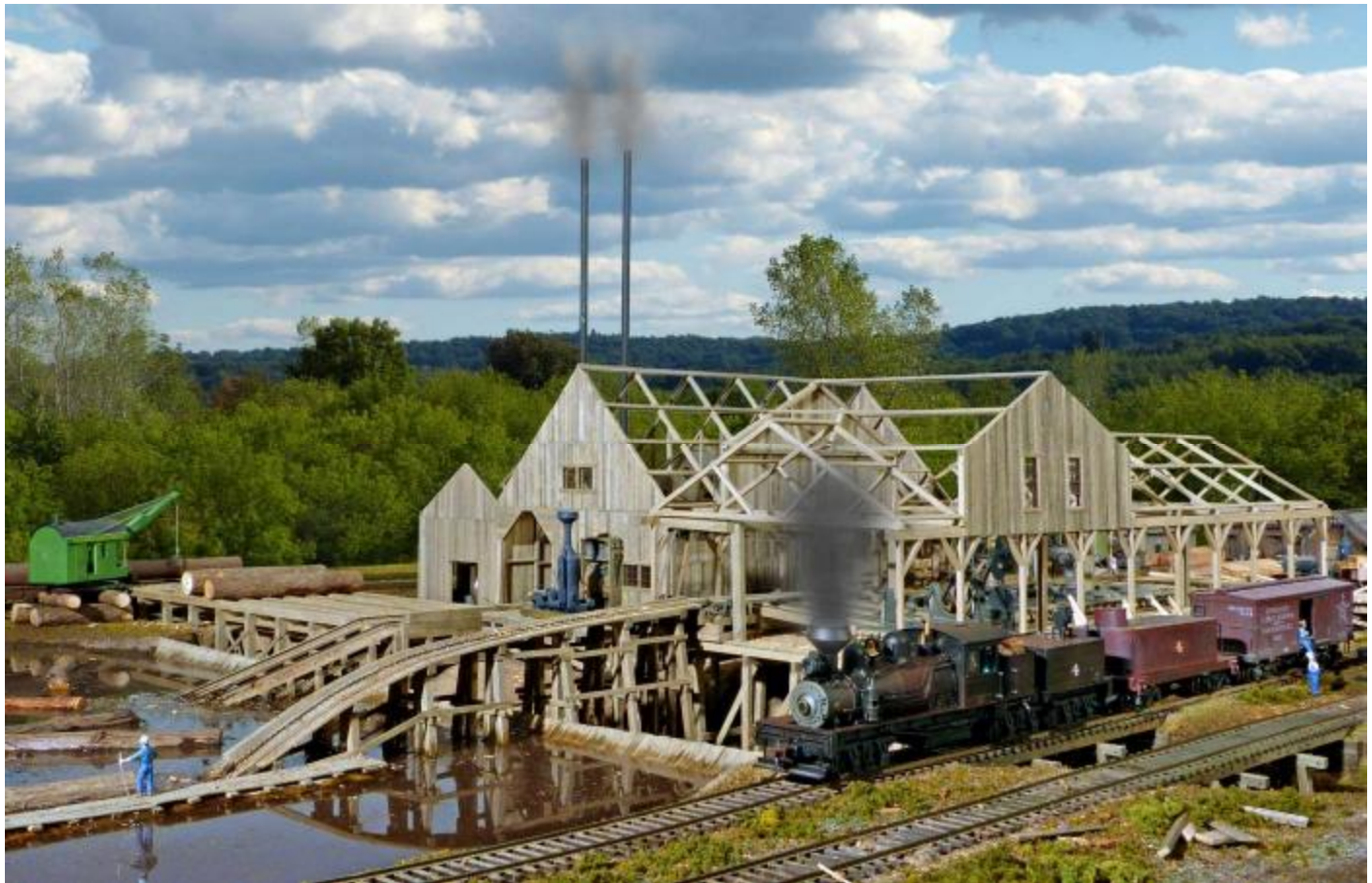
A scene from the Oil Creek RR, one of the layouts on tour at the NMRA NFR Regional Convention, May 2015.

Next Lakeshores Division 2014 Event: January 10, 2015 Winter Meet, Auburn, NY