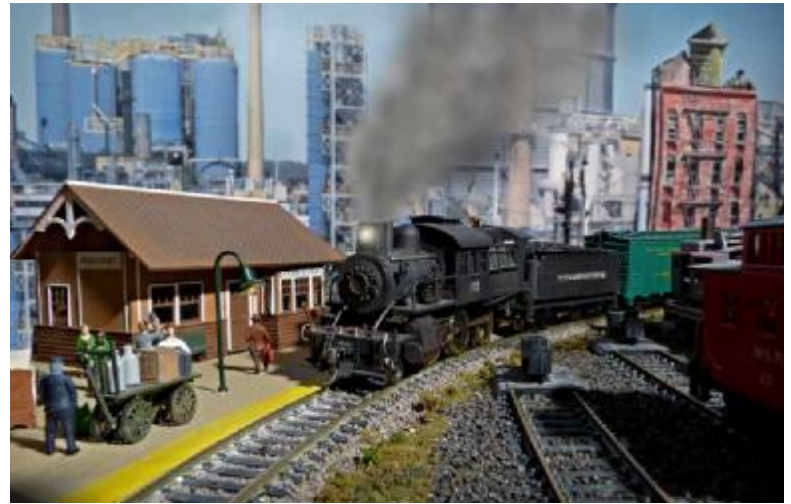
Leo Adamski's model railroad.