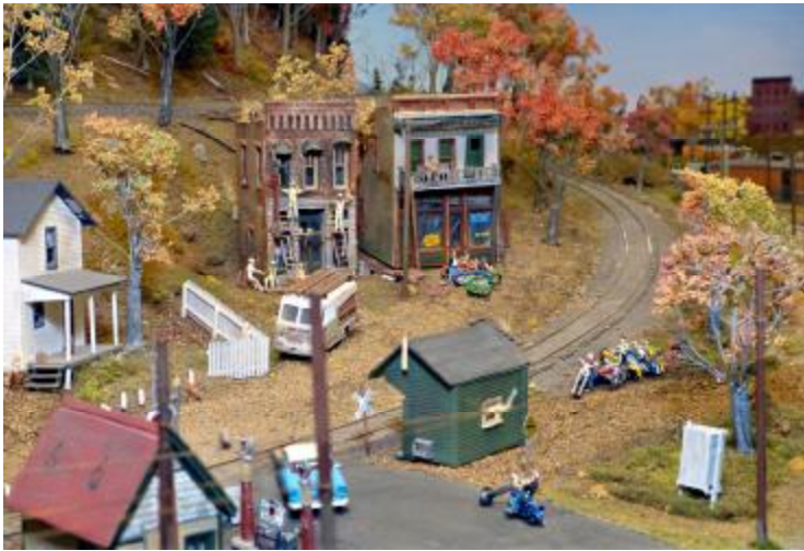
The Rochester Model Railroad Club.