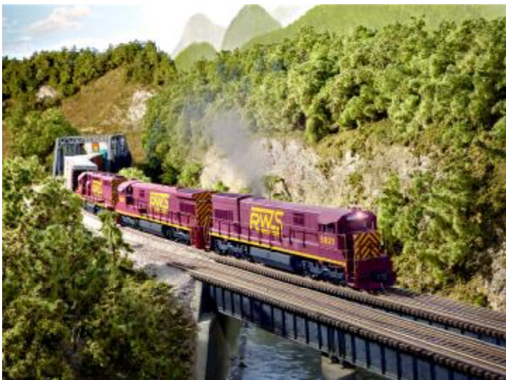
Ron Stacy's model railroad.