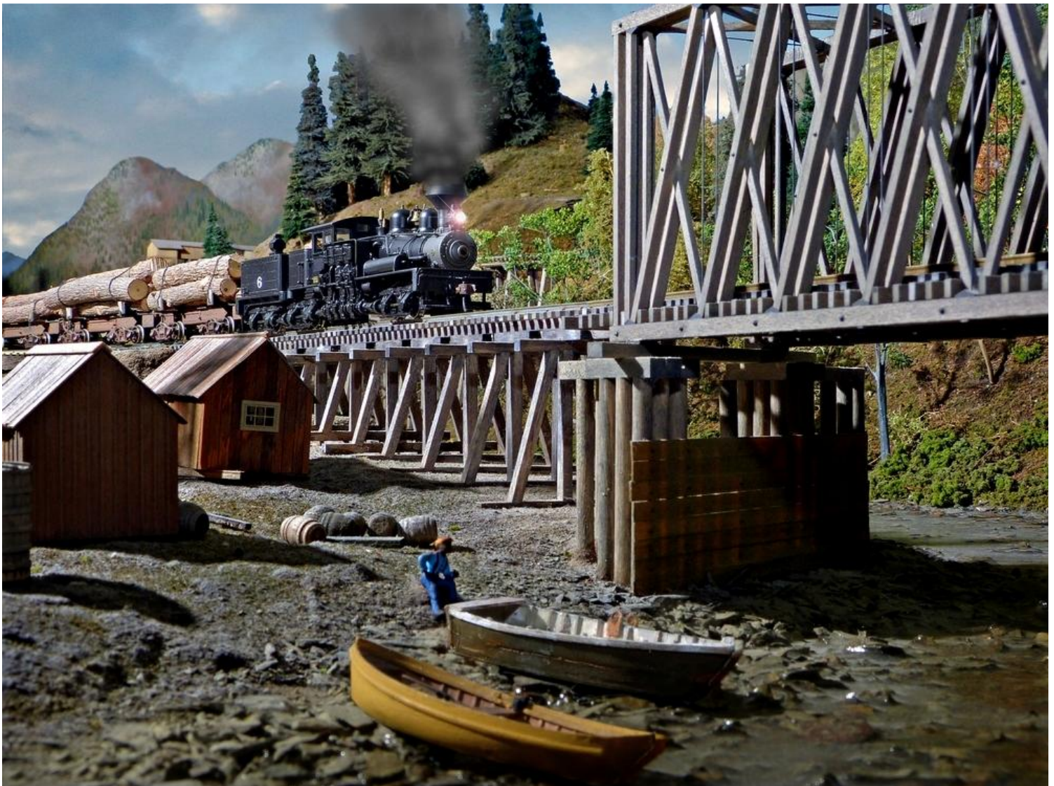
First Place – Bruce Shepard – Image of Dick Senges’ HO scale model RR.