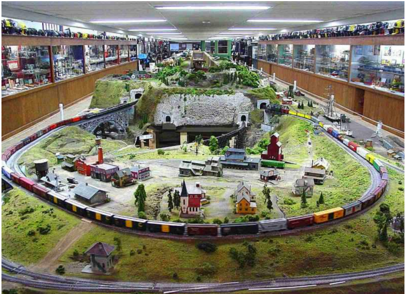
Model railroad at the Medina Railroad Museum, Medina, NY, site of the next Lakeshores Division Meet September 29, 2012. The layout is 14 feet wide and 204 feet long. Control is NCE DCC.

Next Lakeshores Division Meet – September 29, 2012 – Medina, NY