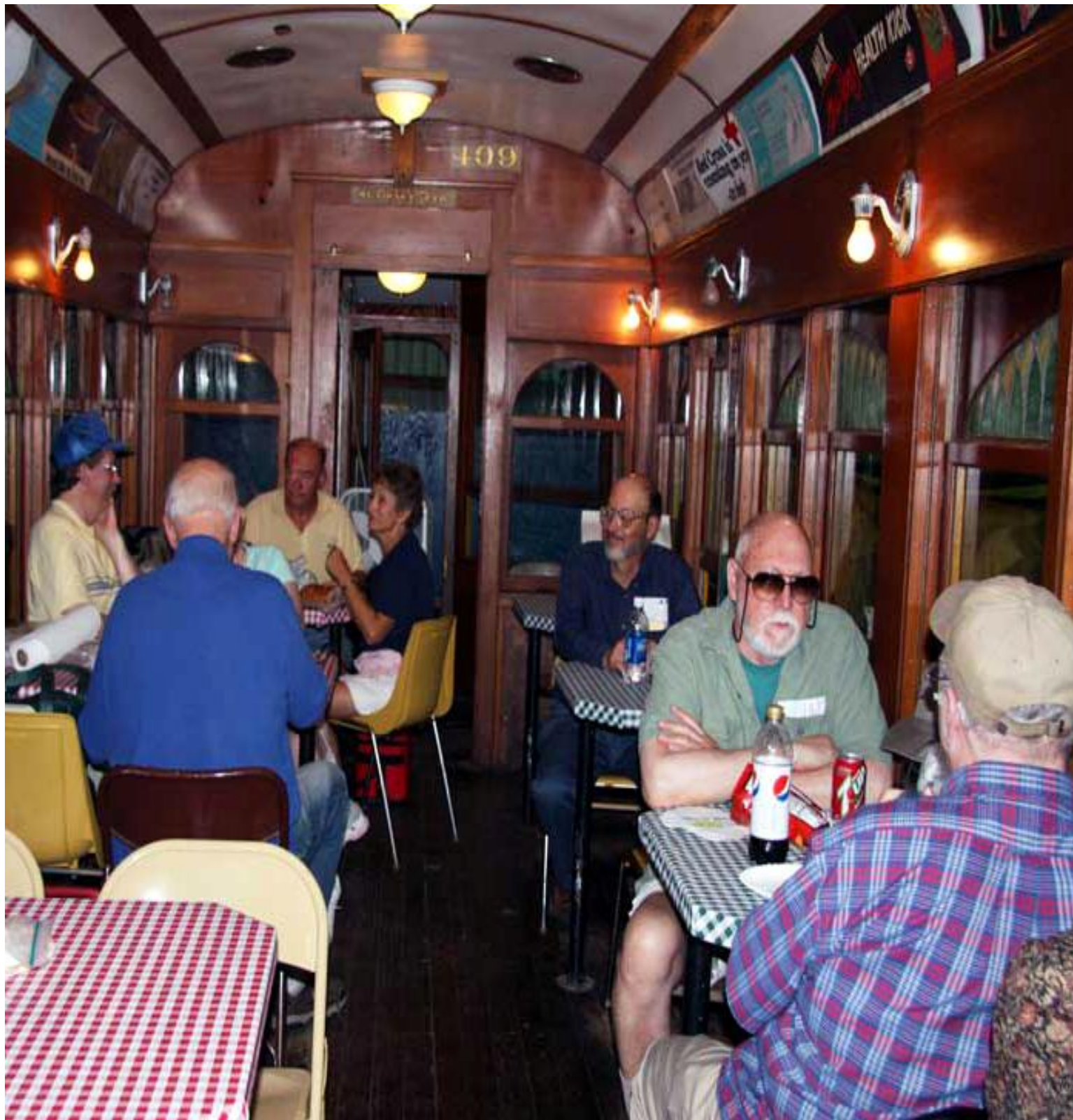
LSD members enjoying their picnic lunch in the Museum's dining car.