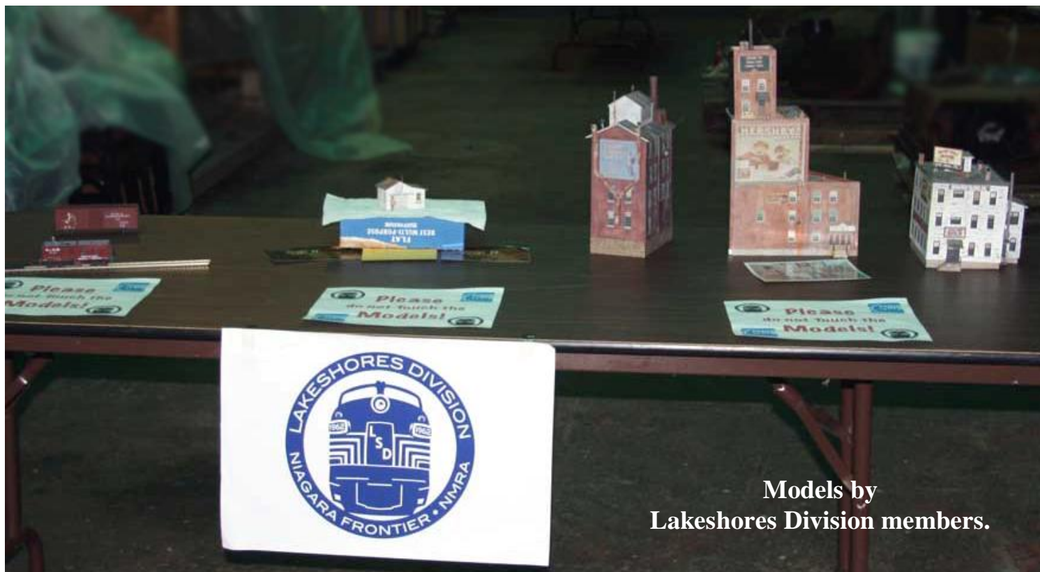
Models by Lakeshores Division members.