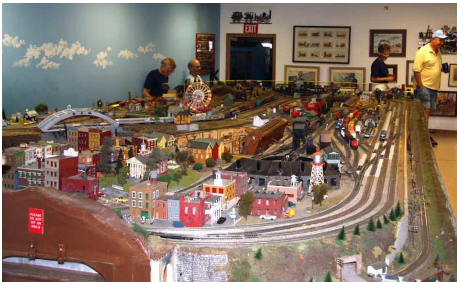
Lakeshores Division members enjoying the Museum's model railroad.