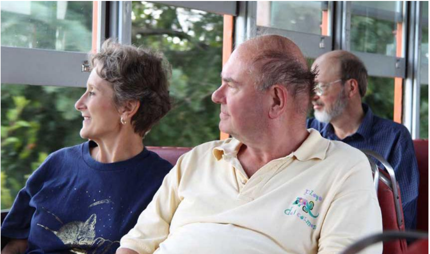
Lakeshores Division members enjoying riding the street car.