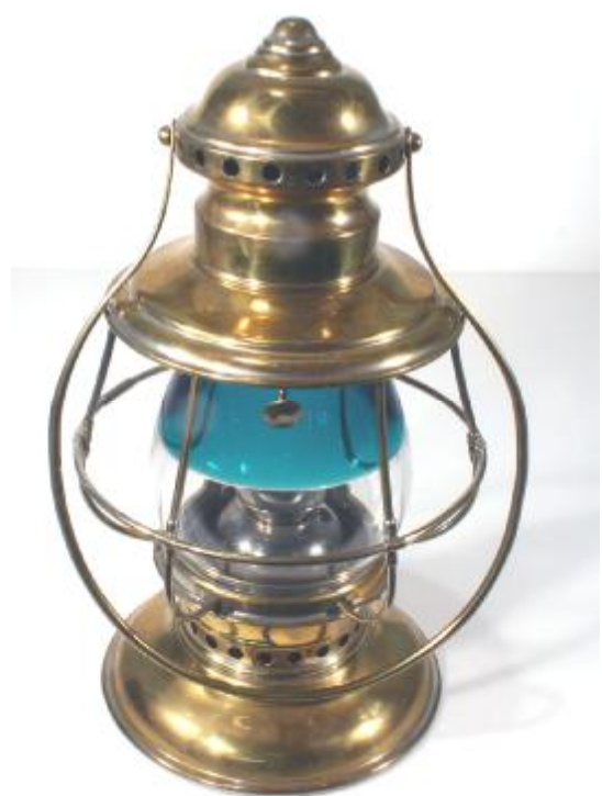
Brass Conductor - green over clear