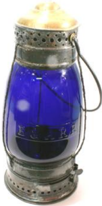
Boston & Albany RR – cobalt cast globe