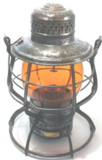
Burlington Route – etched globe