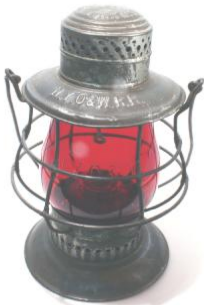
N Y O & W R R – red cast globe