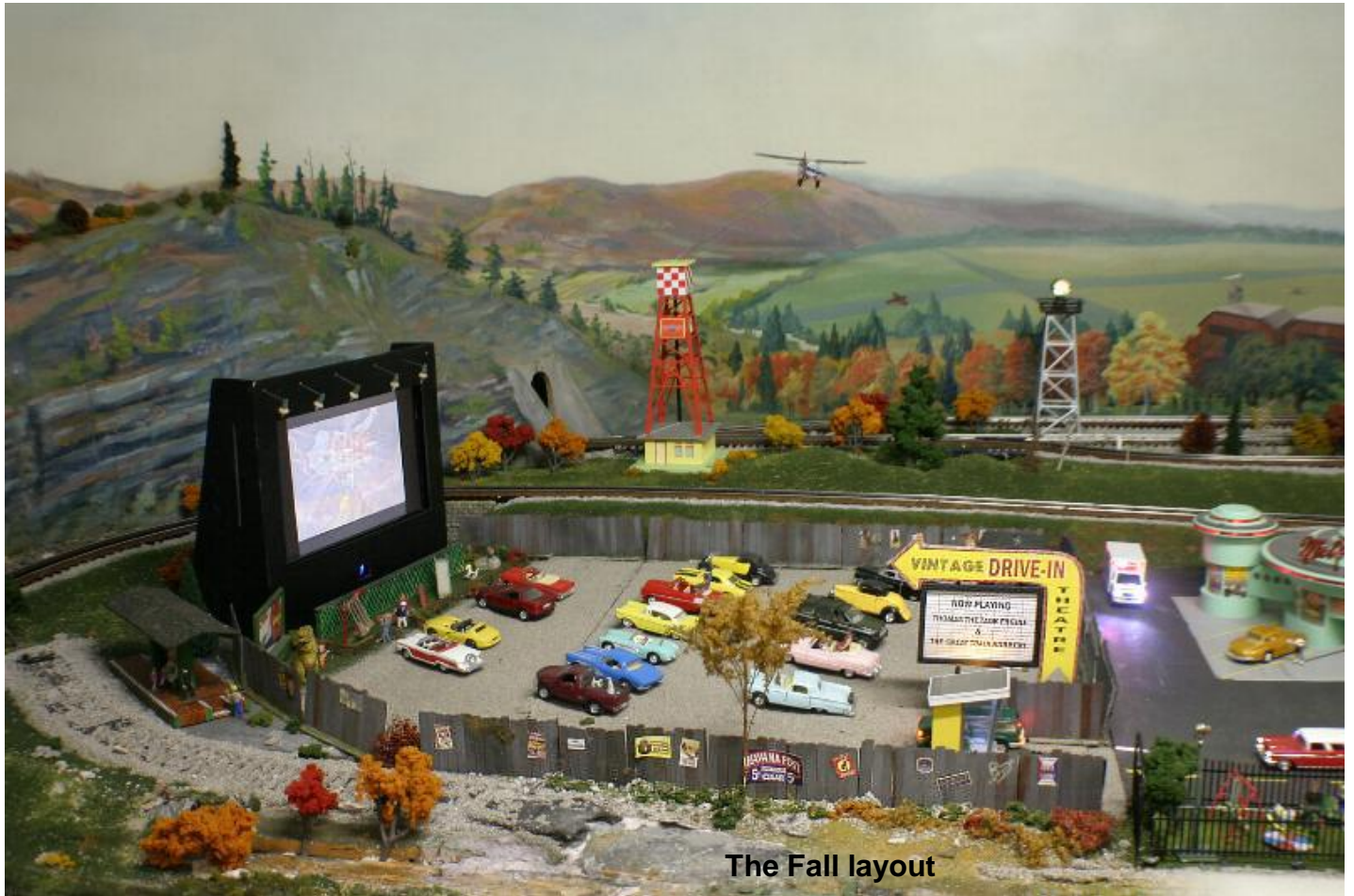
The Fall layout