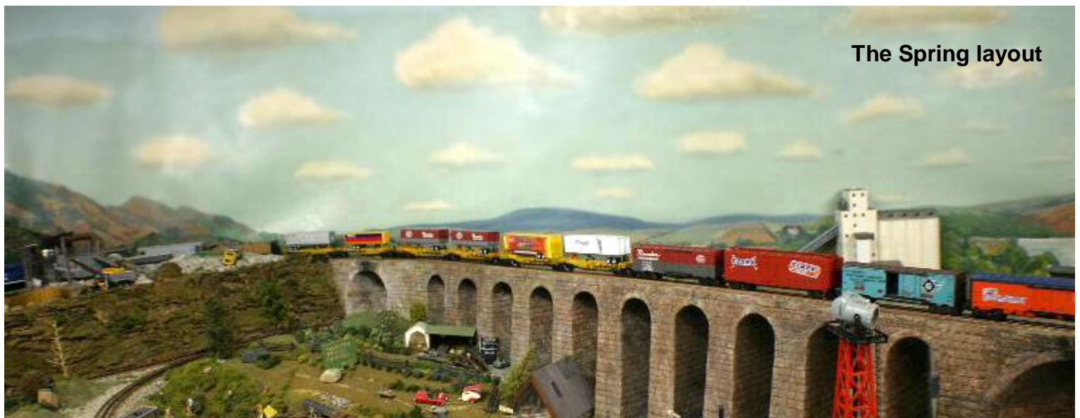
The Spring layout