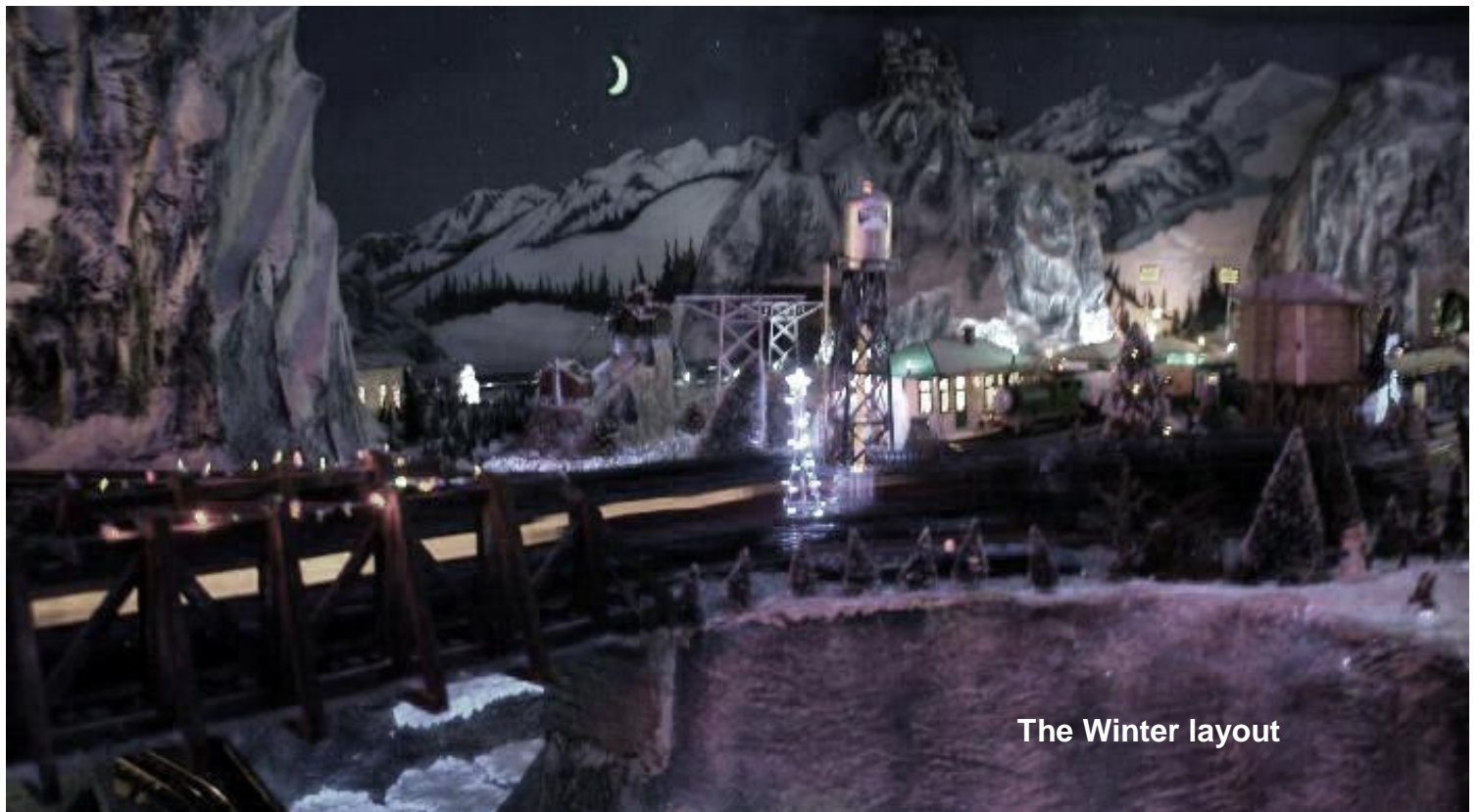
The Winter layout