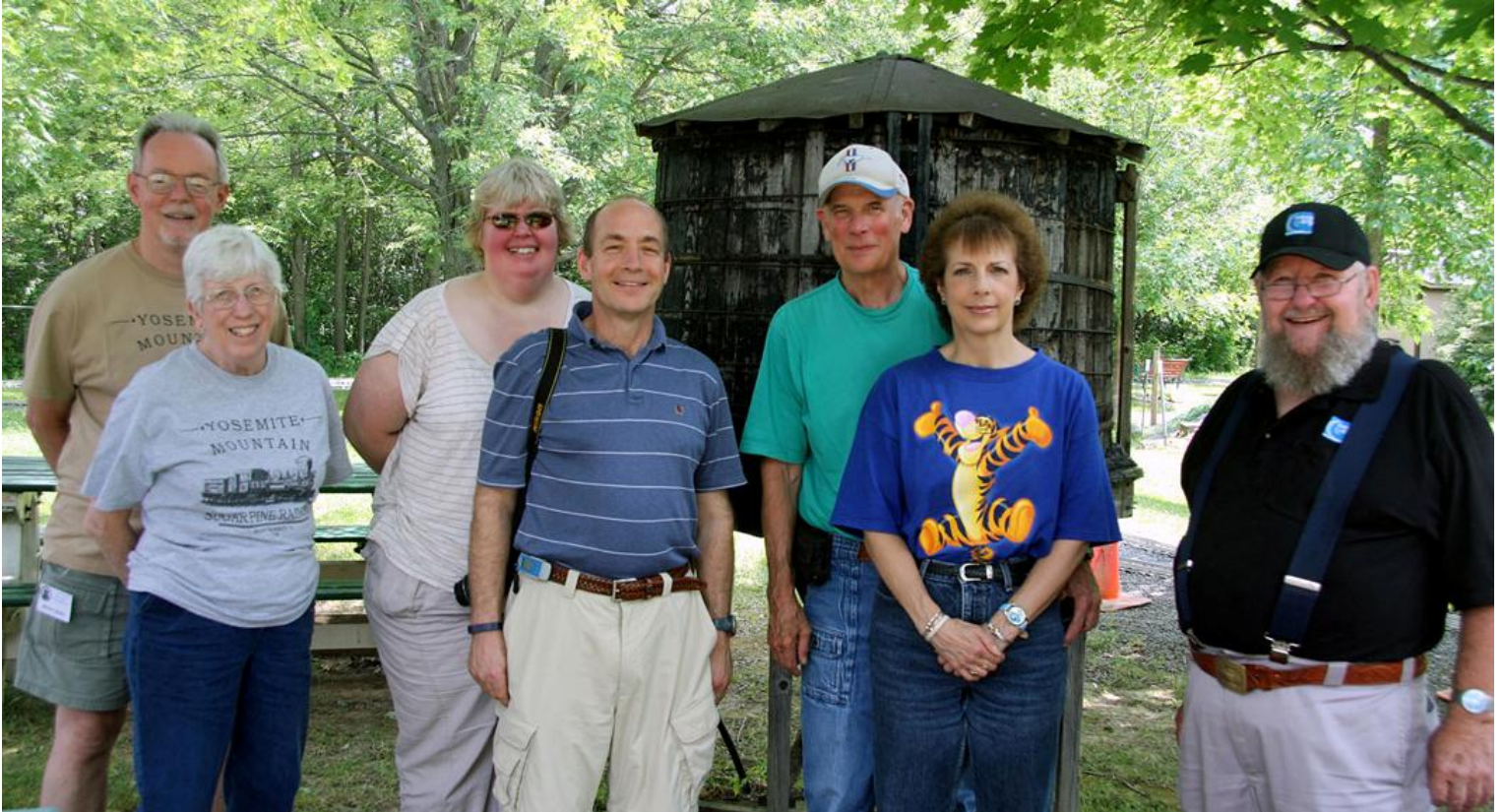
Folks attending the 2014 NMRA Lakeshores Division picnic at the Finger Lakes Live Steamers.