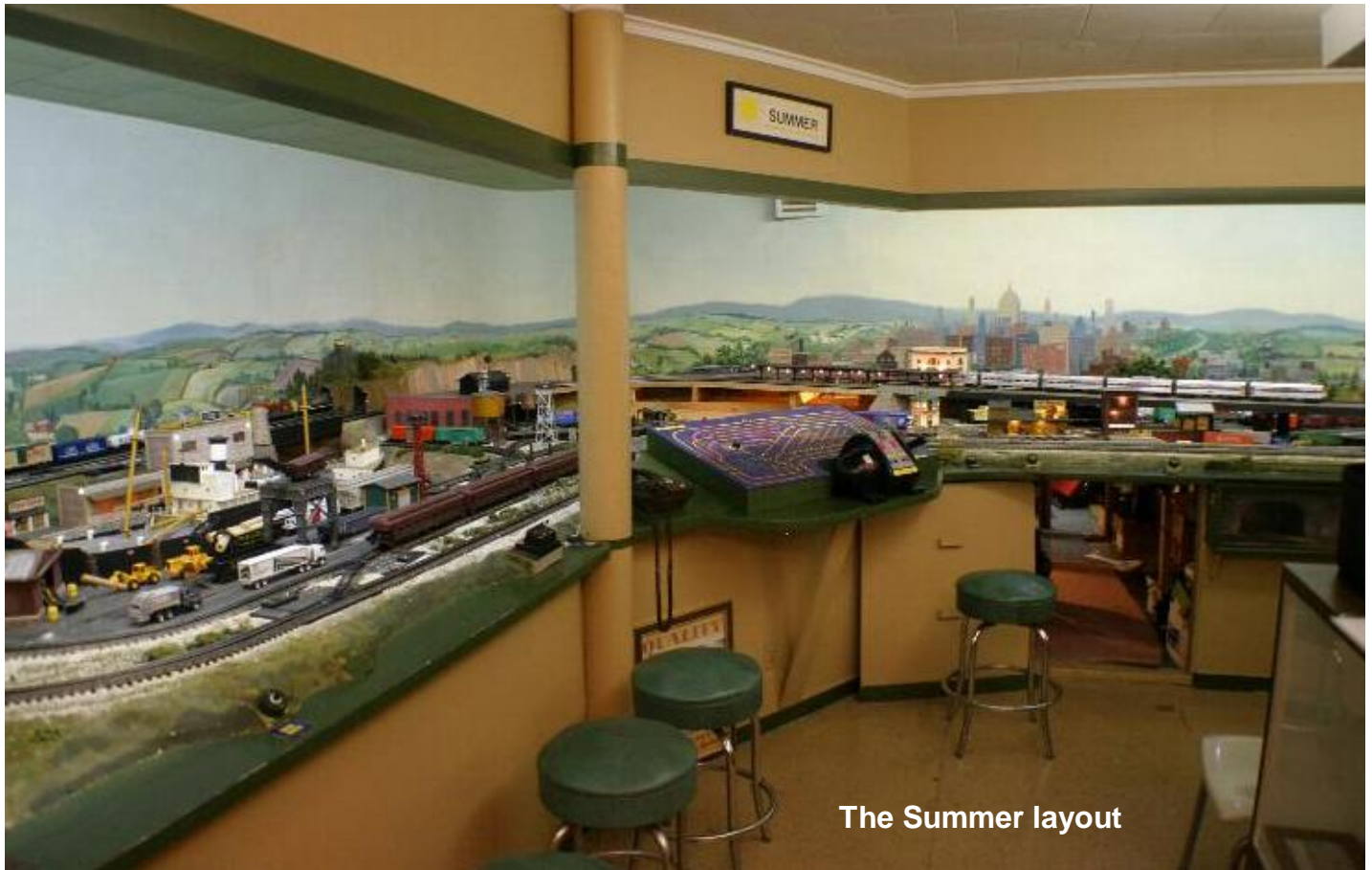
The Summer layout