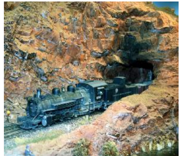
#486 Blasting through a tunnel on Lex Parker's Denver & Rio Grand Western RR.