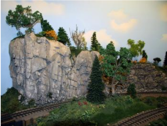
Some amazing rockwork on Dave Manary's On30 layout.