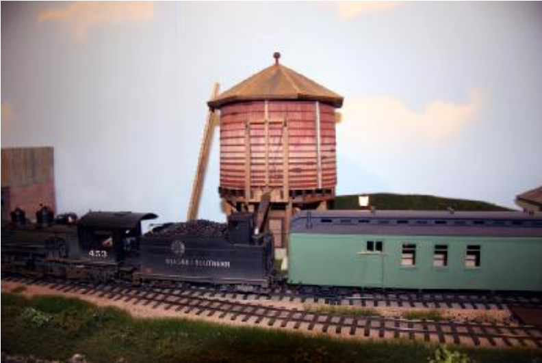
Working Water Tower on Dave Manary's layout. The water spout raises and lowers by remote control.