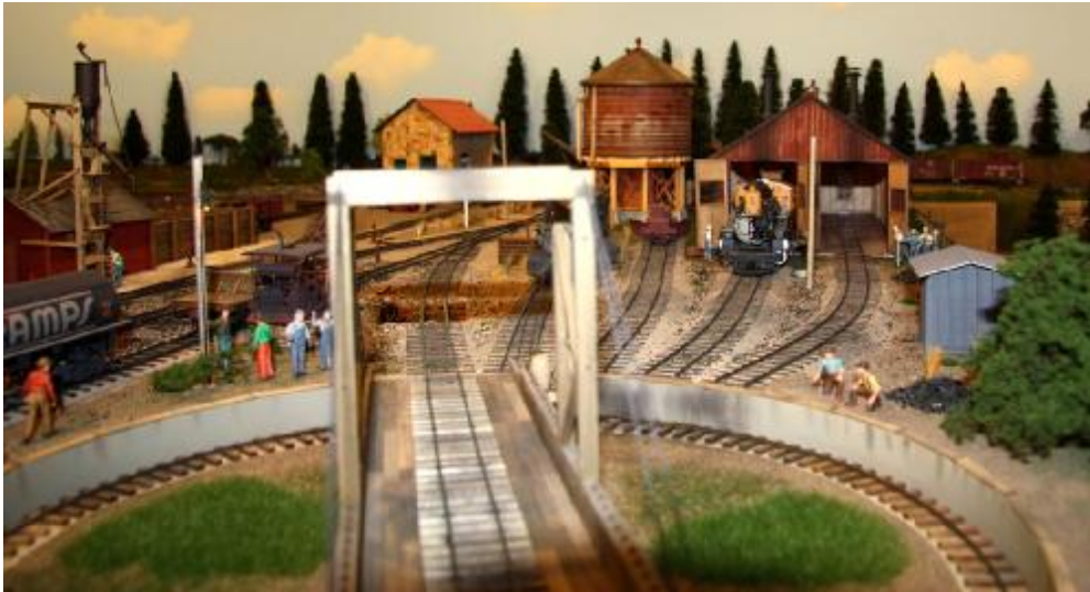
Turntable and Service Facilities on Dave Manary's On30 Niagara Southern Scenic Railway.

Niagara Southern Scenic Railroad On30, 1940's era Peninsula, 12' x 13'. Dave's brass locomotives are with NCE digital control. Rolling stock and structures are both kit and scratch-built. The track is hand laid.