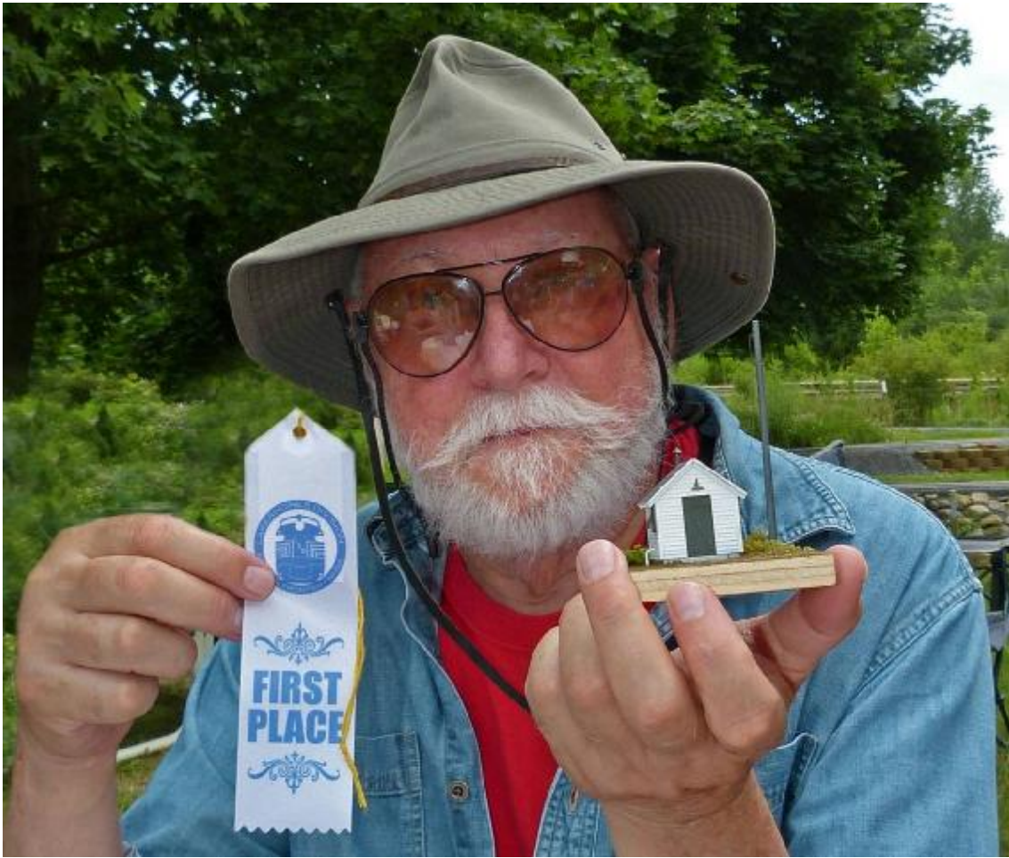
The First Place Model Contest Winner !