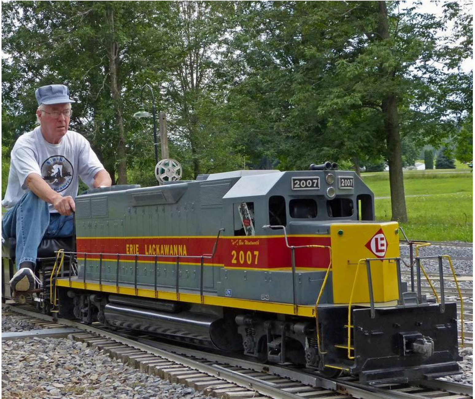
A very large and powerful Erie and Lackawanna Number 2007 diesel locomotive moves along the track at the Finger Lakes Live Steamers, Clyde, NY, on a pleasant summer's day in 2013.