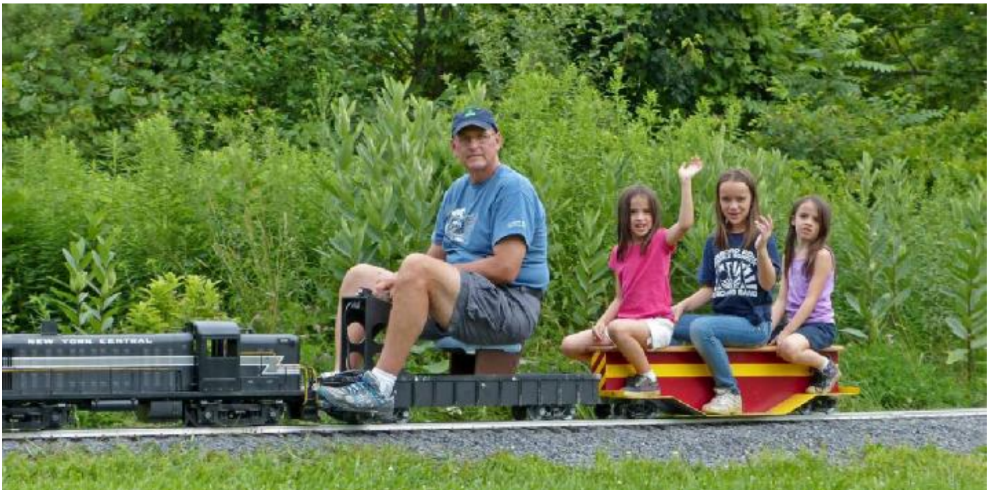
A New York Central diesel motors along with three important passengers !