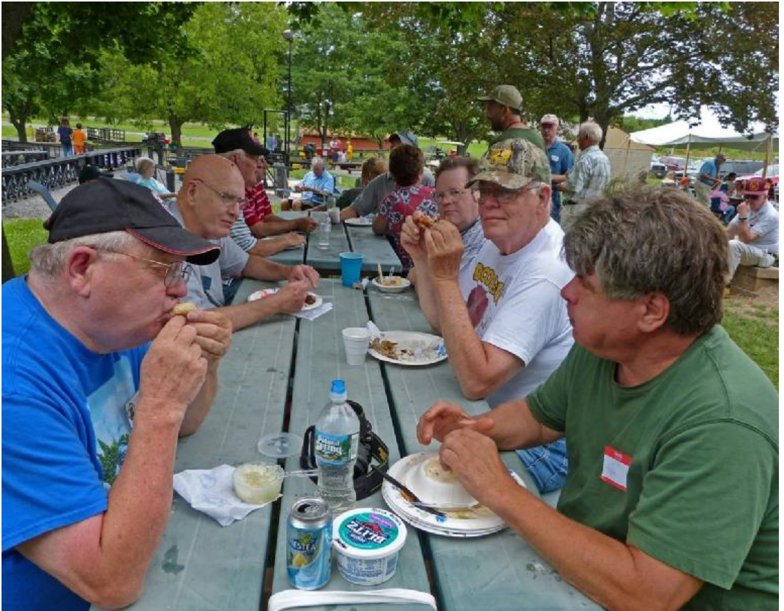
A great day for a picnic. Boy that food tasted good !