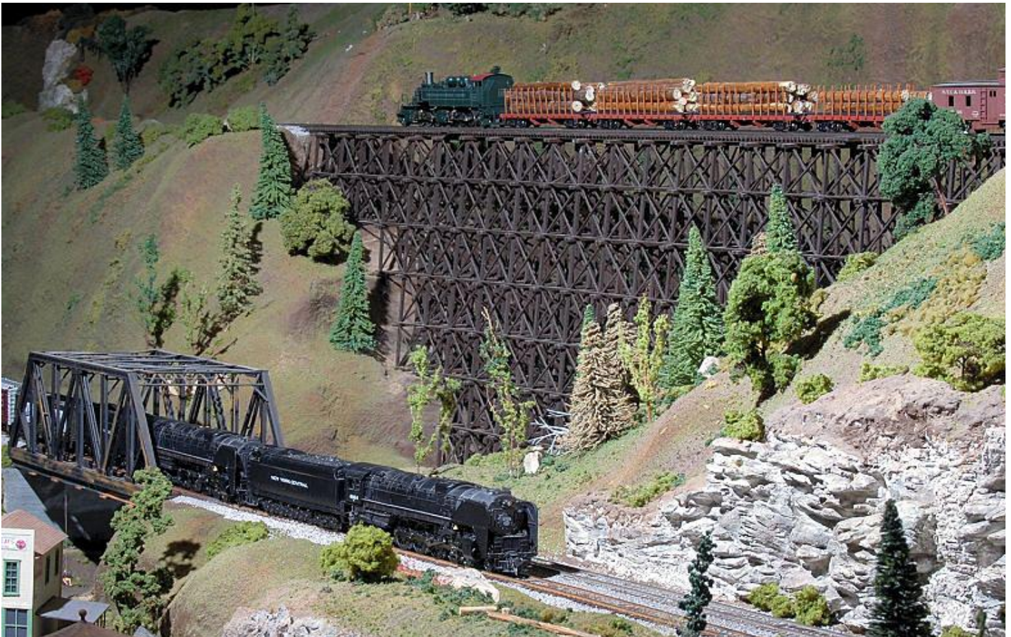
Model railroad at the Medina, NY Railroad Museum, site of the next Lakeshores Division Meet September 29.

Next Lakeshores Division Meet – September 29, 2012 – Medina, NY