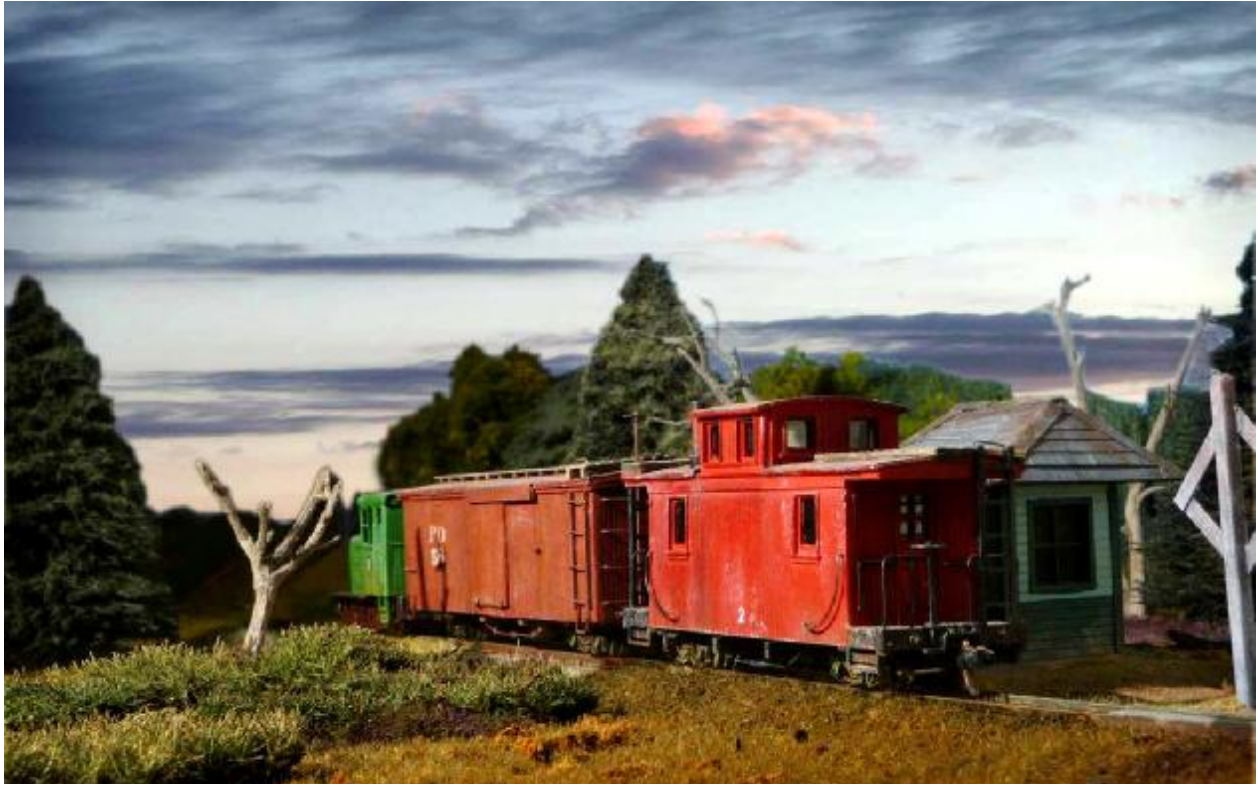
Above: Heading home past the tiny Sandy Creek station.

Below: Maine and Western 1309 waiting by Higbe Farm Supply for a clear signal.