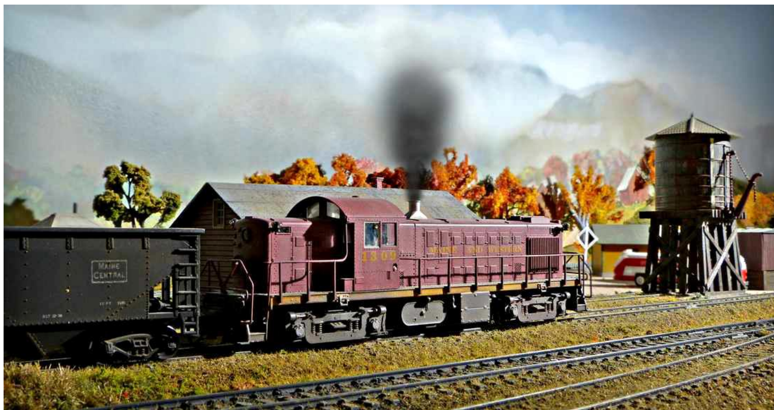
Above: M&W Alco RS1 smokes it up advancing the throttle upon Getting a clear signal to pass the diamond at Quebec Junction.