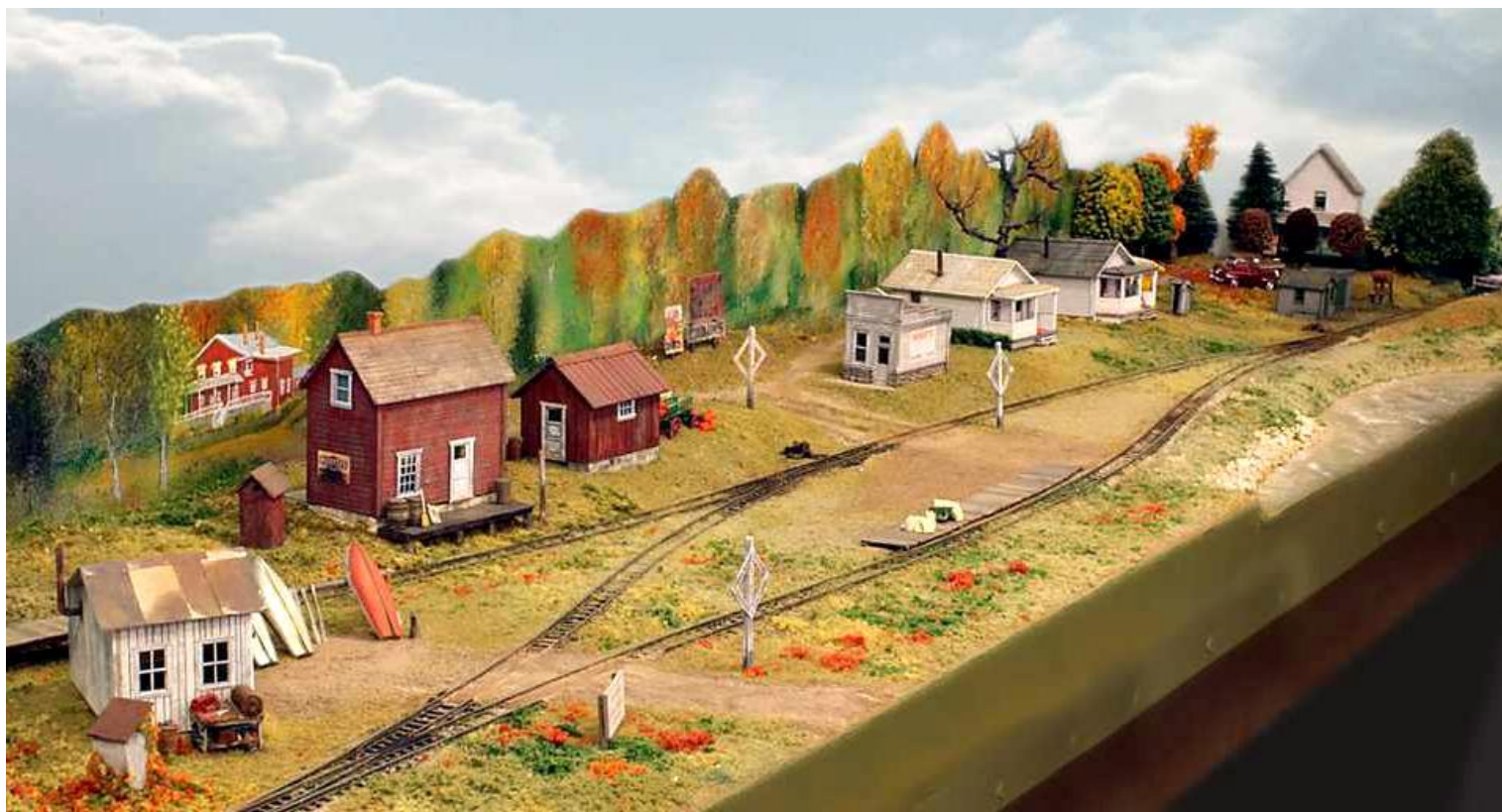
Above: The quiet resort hamlet of South Oneida on the two foot narrow gauge Portage Oneida RR.