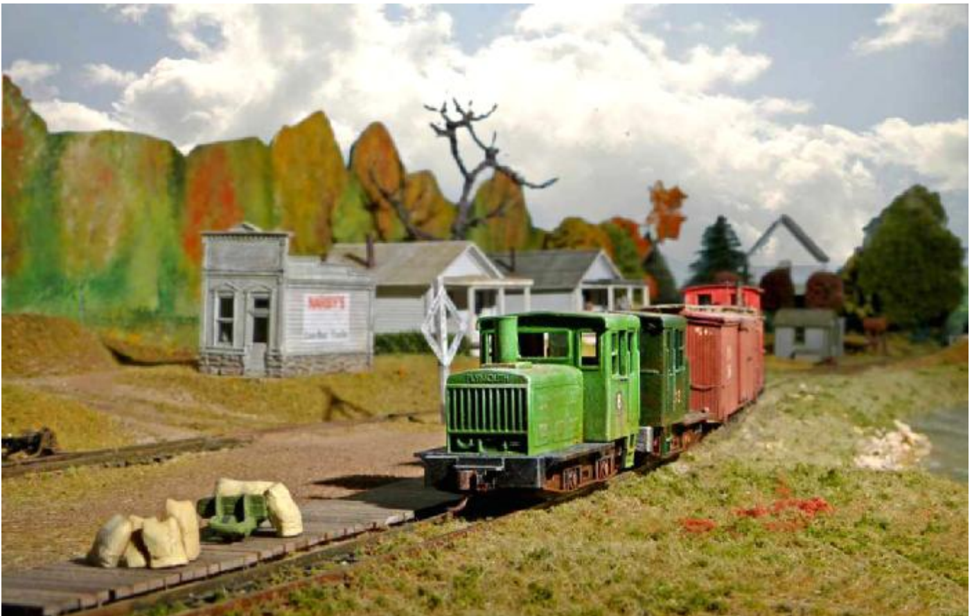
The Portage Oneida sometimes had to use two locomotives to be sure one was still operating when the little train reached Portage.

The Portage Oneida Railroad (P.O.) is based on the Maine twofooter railroad Bridgton and Saco River Railroad. This railroad connected to the Maine Central at Hiram, ME... also know as Bridgton Junction. Bridgton Junction is now Portage Junction on my little railroad. This was only going to be a ten foot module which took on a life of it's own as they say. So that's the story of the two railroads.