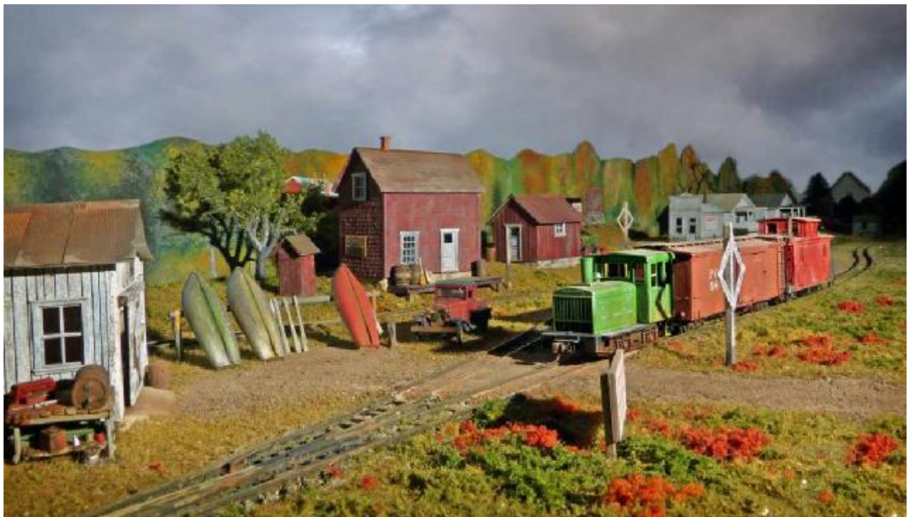
Below: The twofooter P.O. train passing Tarve Boats leaving South Oneida.