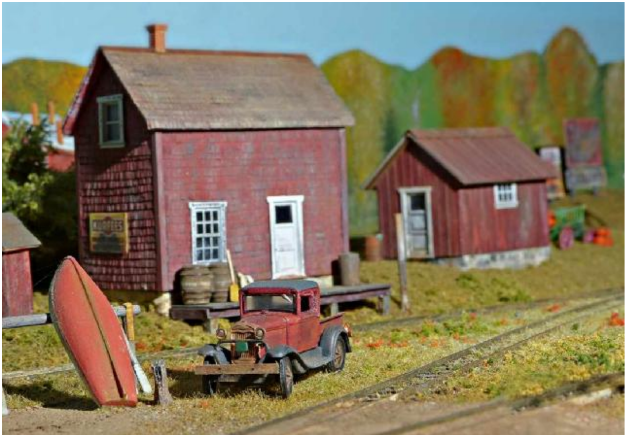
Above: Old man Tarve's old pick up truck is still going strong.