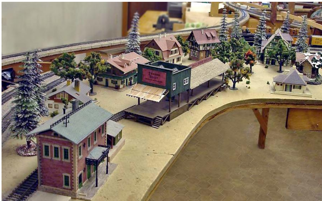
Bob Novak is constructing a small village on his model railroad.