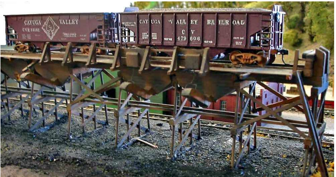
On the CVRR, two coal hoppers wait to be unloaded at Bishop's Coal.