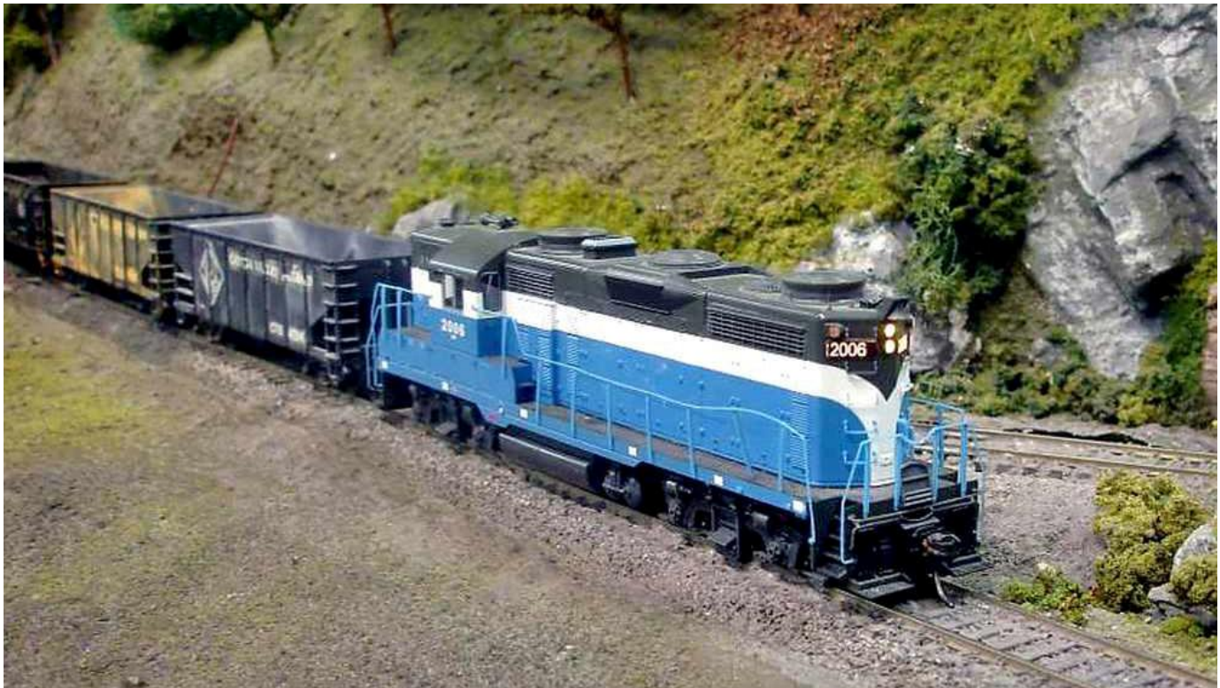
Below: The CVRR Coal extra is heading back to the J. G. Rhodes Coal Company's tippie with a string of empty hoppers.