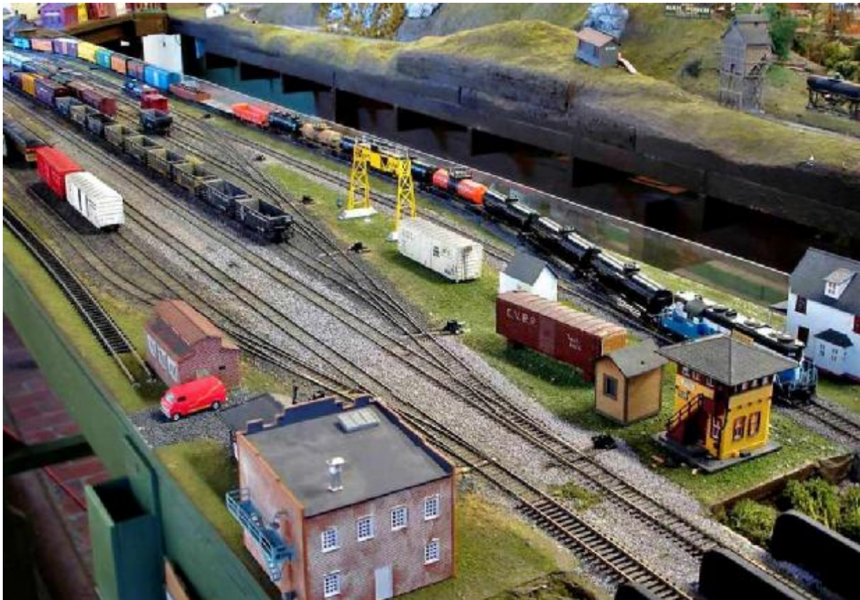
Above: Overall view of the Yard of the Cayuga Valley Model Railroad in Auburn, NY. During operations, all trains depart and terminate from this location.