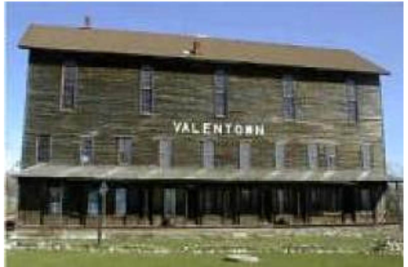
Valentown – an interesting 1879 Victor, NY structure – across from East View Mall – was the planned terminus of a RR in the late 1800s – that never materialized.