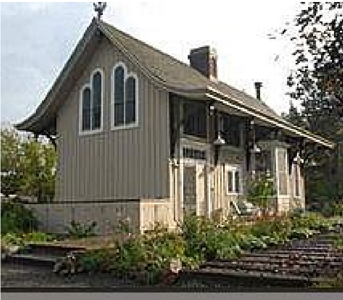
An old D & L W RR depot converted to a private home in Victor, NY.