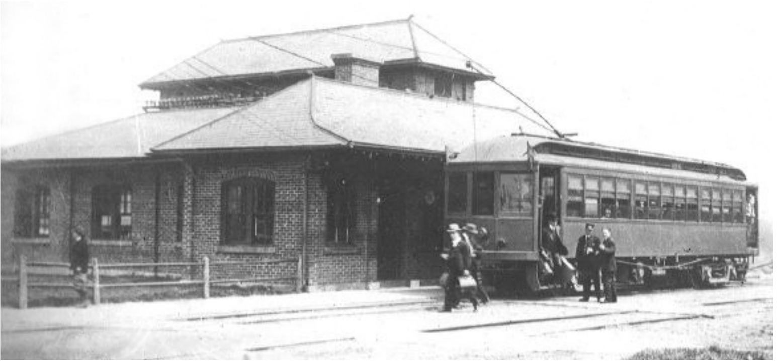
Above: The Rochester and Eastern Rapid Railway trolley depot located on the east side of Maple Street, Victor, NY. It was converted to the Victor Library and now is a private company (2102). It sits near the Black Diamond Bar and across the street from the Victor Feed and Home Center.